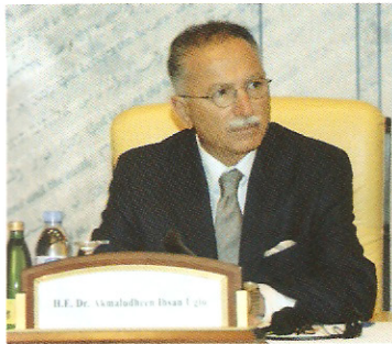
Secretary General of the OIC

Minister of State for Foreign Affairs H.E. Ahmed bin Abdullah Al Mahmoud opened the 7th Doha Conference on Interfaith Dialogue. Addressing the opening session, H.E. the Minister said the conference has become a notable event that practically represents Qatar, under the wise leadership of H.H. the Emir Sheikh Hamad bin Khalifa al Thani, as a believer in the significance of solidarity among religions, which certainly help maintain world peace and security. "Believing in God, worshiping Him and constructing earth is the key to the human pleasure and peace", H.E. the Minister said. Al Mahmoud referred to the current situation in world communities, including wars and destruction, poverty, disease and ignorance, starvation, natural disasters, the widening gap between the rich and the poor, the absence of social justice, deterioration of human rights and basic freedoms, all together require, more than any time before, an effective action to be taken by religions, in order to save human communities. H.E. the Minister of State for Foreign Affairs also referred to the previous six conferences held in Doha, which he said have greatly helped thawing the ice and removing the psychological barriers standing between the followers of divine religions, barriers that never existed before, but recently resulted because of oppression, aggression and non-administration of justice.