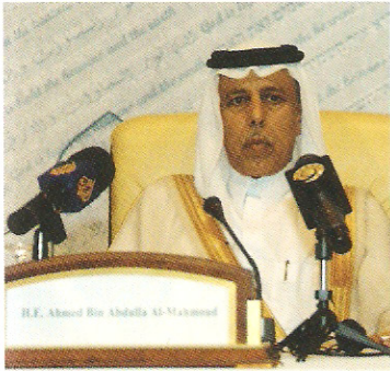
Minister of State for Foreign Affairs

Minister of State for Foreign Affairs H.E. Ahmed bin Abdullah Al Mahmoud opened the 7th Doha Conference on Interfaith Dialogue. Addressing the opening session, H.E. the Minister said the conference has become a notable event that practically represents Qatar, under the wise leadership of H.H. the Emir Sheikh Hamad bin Khalifa al Thani, as a believer in the significance of solidarity among religions, which certainly help maintain world peace and security. "Believing in God, worshiping Him and constructing earth is the key to the human pleasure and peace", H.E. the Minister said. Al Mahmoud referred to the current situation in world communities, including wars and destruction, poverty, disease and ignorance, starvation, natural disasters, the widening gap between the rich and the poor, the absence of social justice, deterioration of human rights and basic freedoms, all together require, more than any time before, an effective action to be taken by religions, in order to save human communities. H.E. the Minister of State for Foreign Affairs also referred to the previous six conferences held in Doha, which he said have greatly helped thawing the ice and removing the psychological barriers standing between the followers of divine religions, barriers that never existed before, but recently resulted because of oppression, aggression and non-administration of justice.