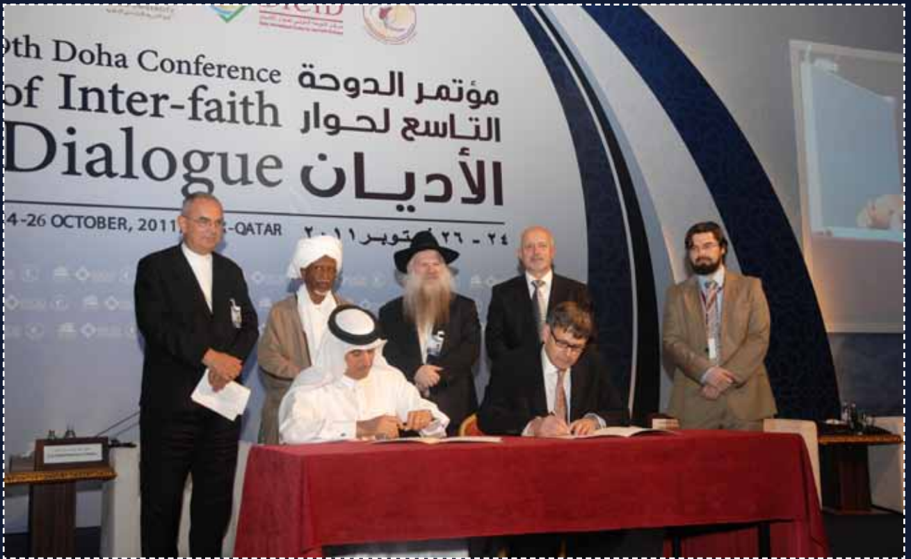
Signing Memorandum of Understanding between DICID & WOOLF Institute - Cambridge University